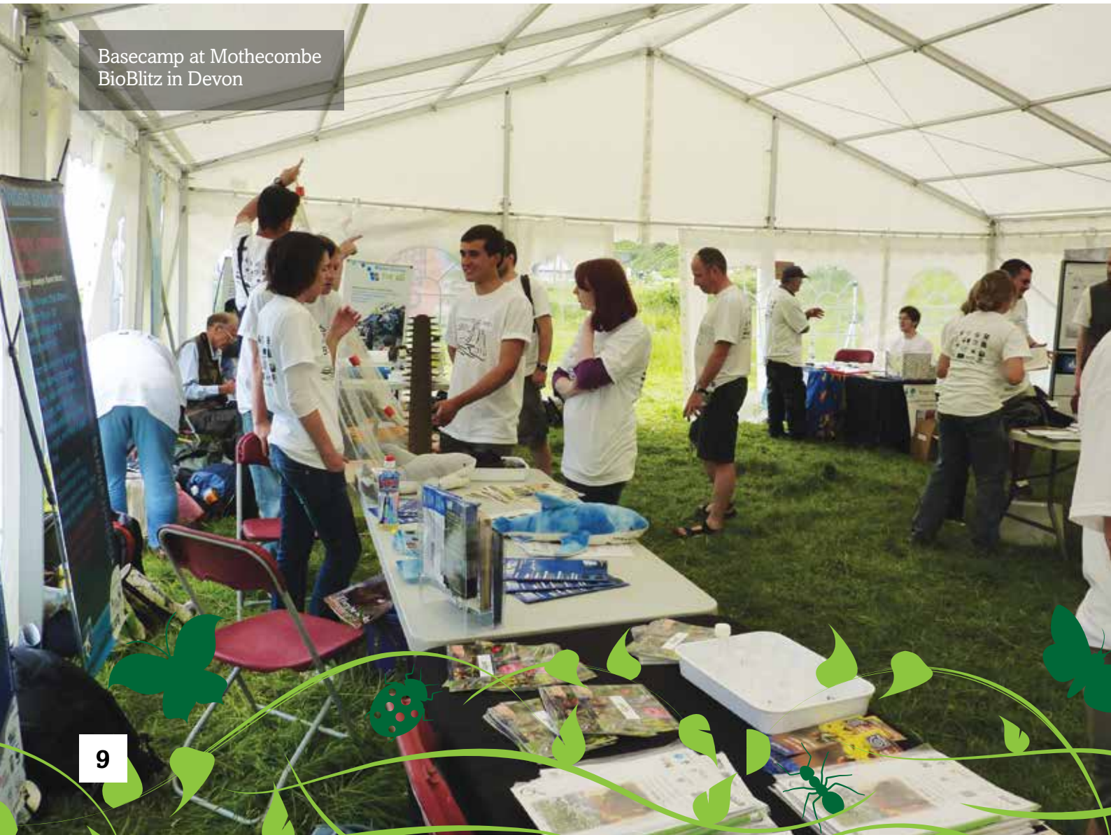
Basecamp at Mothecombe BioBlitz in Devon