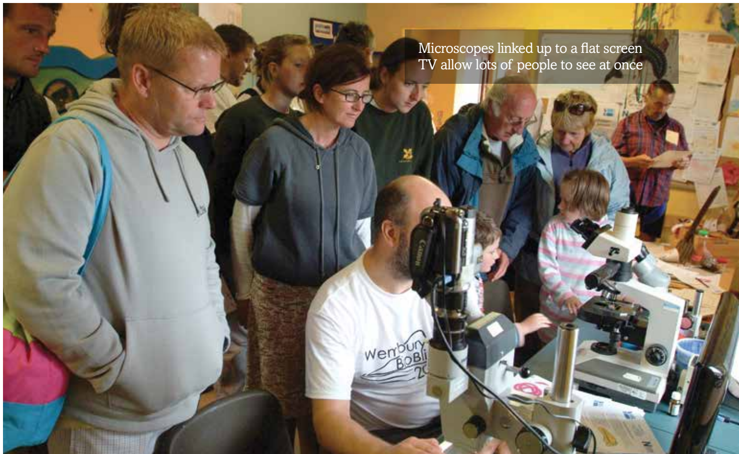
Microscopes linked up to a flat screen TV allow lots of people to see at once