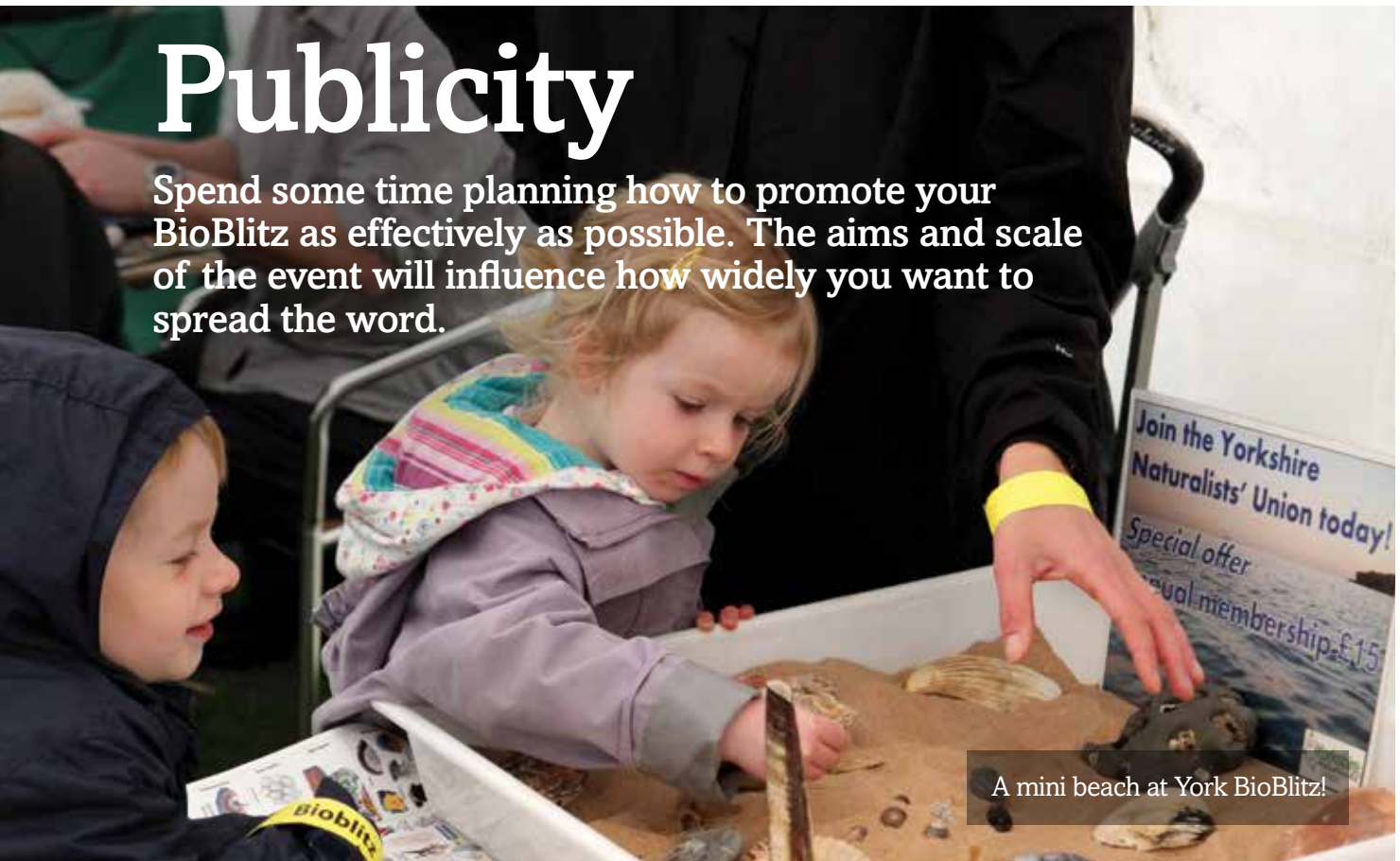
A mini beach at York BioBlitz!

Spend some time planning how to promote your BioBlitz as effectively as possible. The aims and scale of the event will influence how widely you want to spread the word.